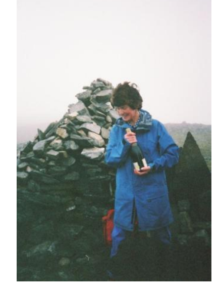
Beinnna Lap 2023