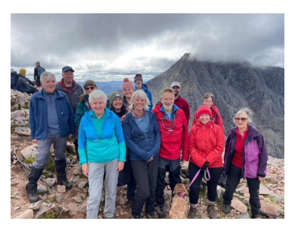
On top with Jinty

The celebration on the top and the sheer sense of celebration from people out with our group who arrived at the top can only be described as joyous