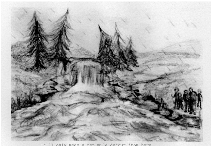
It'll only mean a ten mile detour from here .....

Any lessons learned? Well it would have been safer to have continued along the ridge past the final stream before descending, despite the fact that we were tiring. It would have been even safer to descend from The Storr back to the start point – but that would have been feeble wouldn’t it!